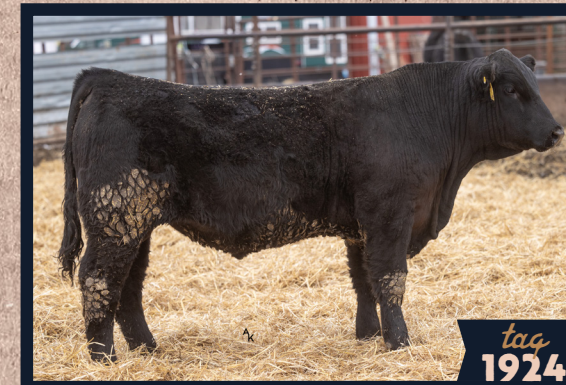
REG # 4324371 | PB SM LCDR FAVOR 149F X LCDR TRAILBLAZER 217E