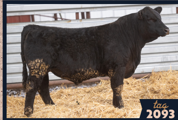
REG # 4324380 | 5/8 SM 3/8 AN TJ MAIN EVENT 503B X WS REVIVAL