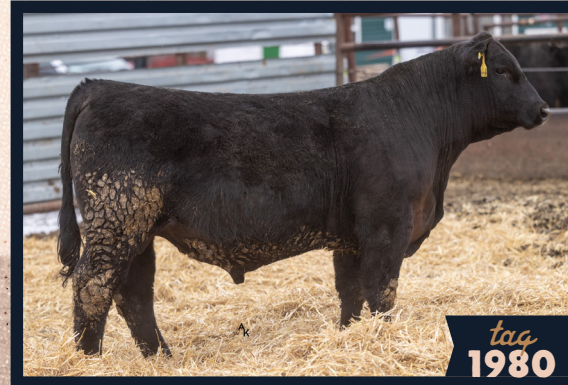
REG # 4324370 | 5/8 SM 3/8 AN TJ MAIN EVENT 503B X BCLR POWER GRID D611-1