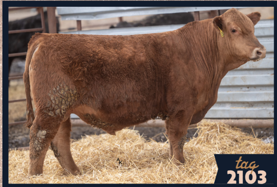
REG # 4324390 | PB SM BRIDLE BIT RED ROCK G9124 X BGL ROOSTER D181B