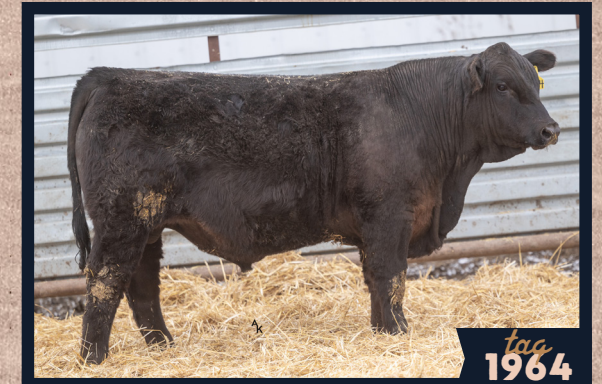
REG # 4324372 | PB SM KBHR MR IMPACT J177 X BCLR ARTILLERY E21-3

Selling 15 Yearling Bulls & 12 Open Heifers