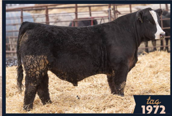
REG # 4324371 | PB SM LCDR FAVOR 149F X LCDR TRAILBLAZER 217E

1 PM • Ransom County Fairgrounds • Lisbon, ND