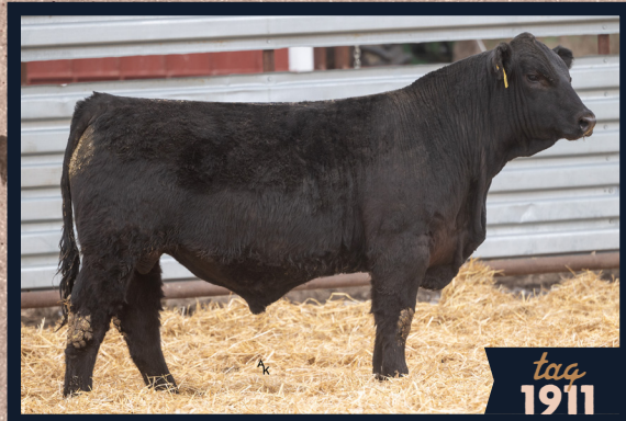
REG # 4324377 | PB SM CLRS GUARDIAN 317G X CCR GRAVITY 9064A