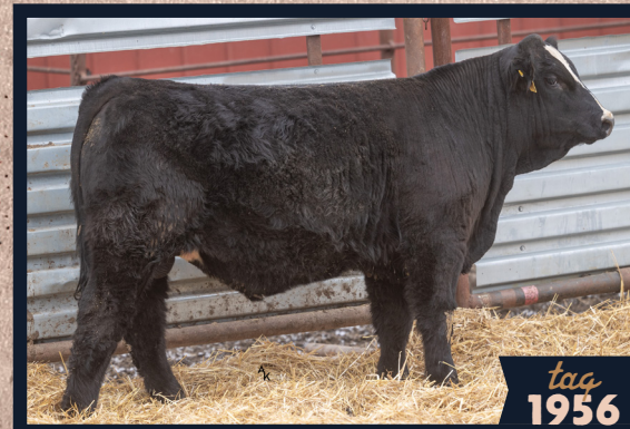
REG # 4324374 | PB SM MR SR HIGHLIFE G1609 X LRS EVOLUTION 328E