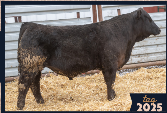
REG # 4324386 | PB SM FIVE STAR GEN-X G4 X CDI MAINLINE 276F

Selling 15 Yearling Bulls & 12 Open Heifers