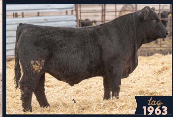
REG # 4324373 | PB SM MR SR HIGHLIFE G1609 X HOOK'S BEACON 56B