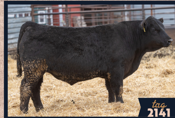
REG # 4324392 | 1/2 SM 1/2 AN S POWERPOINT WS 5503 X BCLR ALAMO F552-3