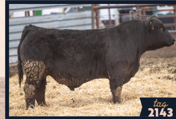
REG # 4324396 | PB SM OMF EPIC E27 X JBS MR CASINO 207E