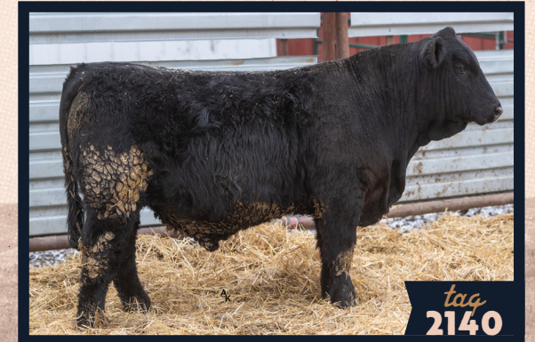
REG # 4324395 | 3/4 SM 1/4 AN HOOK'S FULL FIGURES 11F X KRJ HZN DIRECT IMPACT